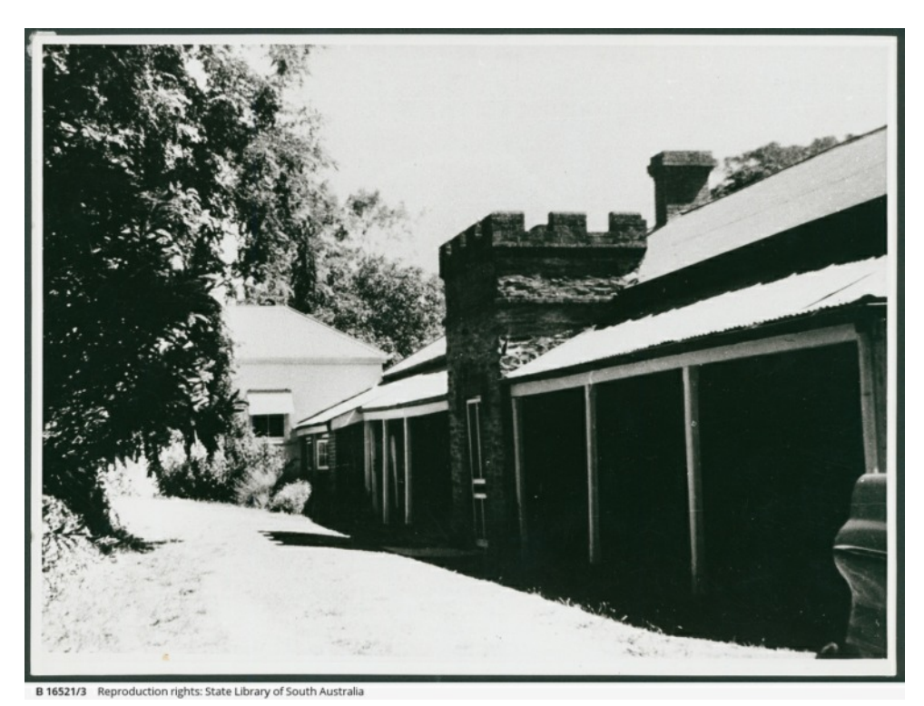
The Dashwood home in Dashwood's Gully

In 1858 after South Australia was given control of its land policies, he tried again and won a remission of £400.